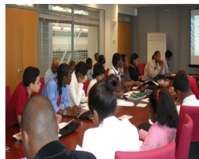
Students listening to presentation at UBS

The UBS trip to Stamford, Connecticut gave me some real insight and some ideas on what I want to do with my life. I know up to this point that I want a major that will lead to an IT based kind of career, but now I am also considering