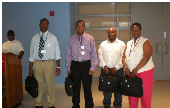
HSCC team pose with laptops awarded to them

(continued from Page 2) "The BDPA-NJ Regional was a fun and learning experience for me. Even though I have experienced a similar event before such as the BDPA-DC National, I still have learned many new things and experienced new situations with another group of people. For example, I have learned teamwork strategies that can help a team win, such as listening to everyone's input and to keep the team integrity high at all times.