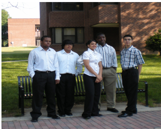
HSCC Team on the Bowie State University campus

(continued from Page 2) where we continued to answer questions about IT and BPA history. Finally, we had to create a web application. My team used languages like HTML, MYSQL, JAVASCRIPT, and PHP.